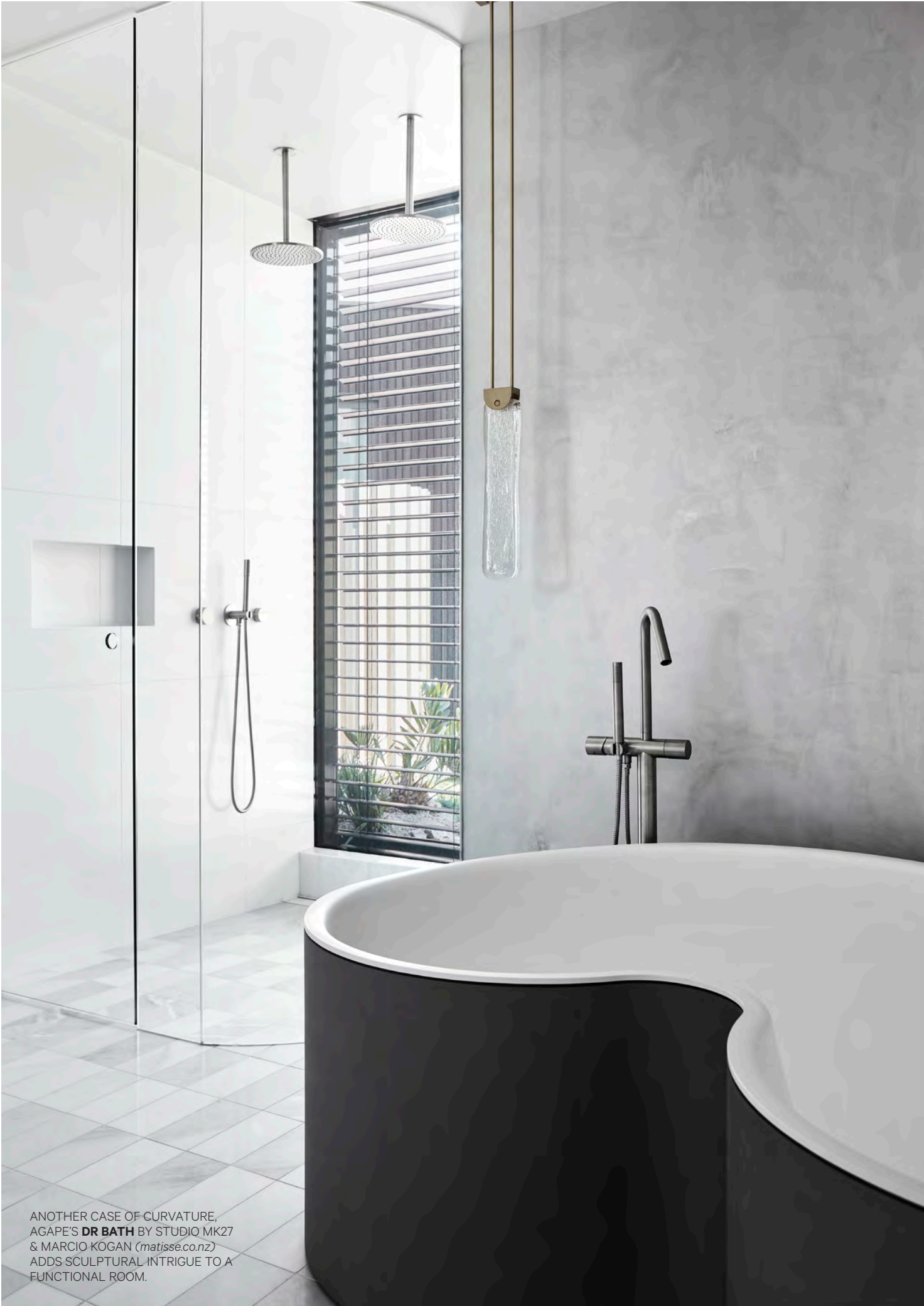
ANOTHER CASE OF CURVATURE, AGAPE'S DR BATH BY STUDIO MK27 & MARCIO KOGAN ( matisse.co.nz ) ADDS SCULPTURAL INTRIGUE TO A FUNCTIONAL ROOM.

The lighting is programmed for different times and moods and, with no traditional switches at all in the house, is entirely controlled by the family's smartphones. From the master bedroom, a glamorous space designed after a hotel suite with heavy, velvet curtains and a champagne nook in the corner, to the basement, with a translucent onyx bar, a lounge, a dance floor, a temperature-controlled wine cellar and a window offering an underwater view of the pool, this home gives the 'entertainer's paradise' a sophisticated reimagining without ever forgetting the essentials of a family home: cosiness, functionality and warmth.