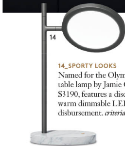
14_SPORXY LOOKS Named for the Olympic sport, the 'Discus' table lamp by Jamie Gray for MatterMade, $3190, features a disc enclosure that houses warm dimmable LEDs with an even light disbursement. criteriacollection.com.au