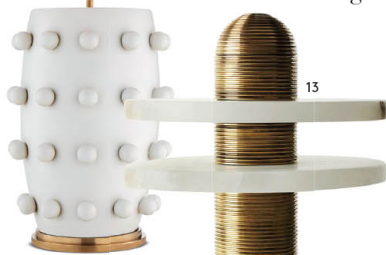
13_GOING BACK EAST With translucent alabaster planes intersected by a fluted brass form, the 'Median' table lamp by Apparatus Studio, $7755, is a nod to traditional Middle Eastern jewellery with a futuristic edge. criteriacollection.com.au

Kelly Wearstler's 'Linden' table lamp, $2199, for Visual Comfort boasts the American designer's signature use of decorative spheres and repetition. bloomingdales.com.au