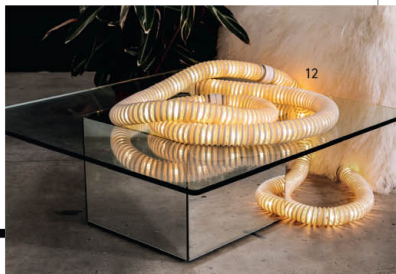
12_LONG STORY Designed by Livio Castiglioni and Gianfranco Frattini in the 70s, the Artemide 'Boalum' light, $1900, is made from a translucent flexible tube that can be shaped in various ways. castorina.com.au