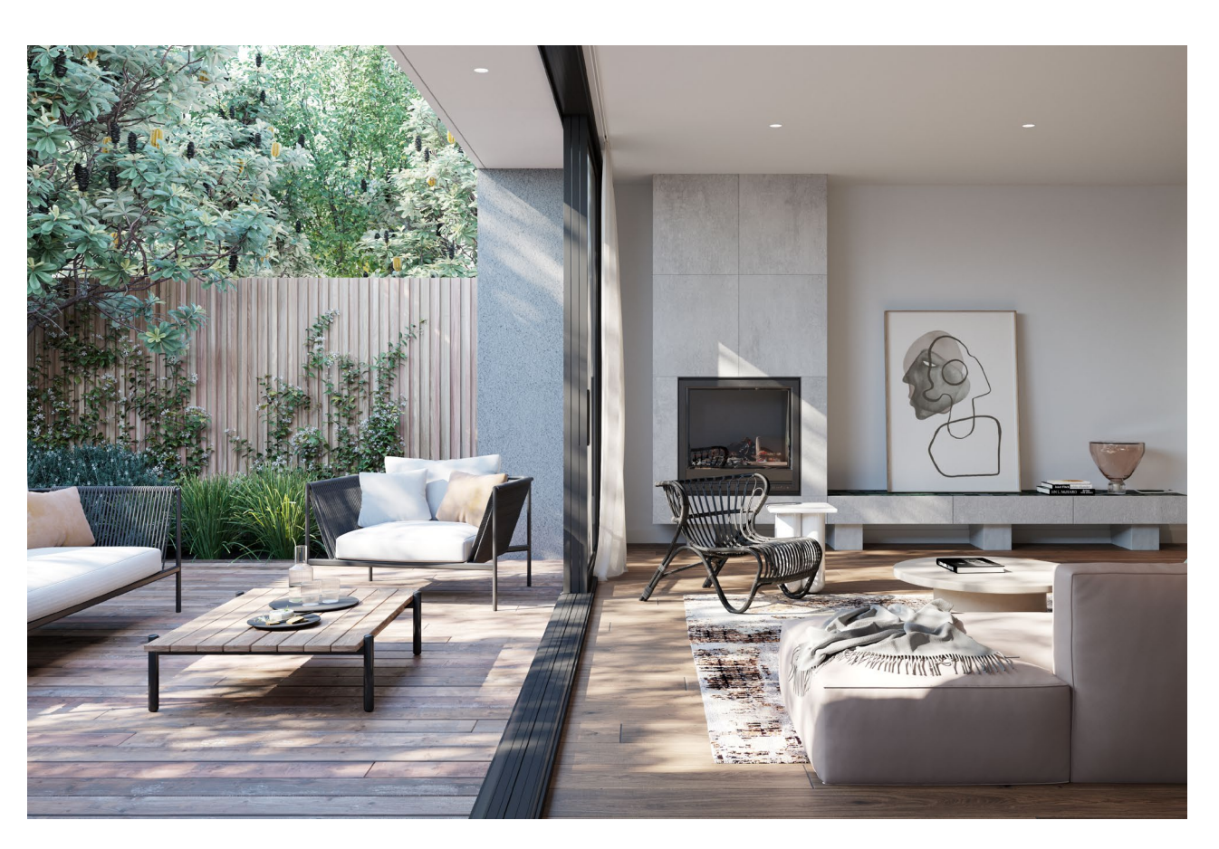
The residences place a great deal of emphasis on blurring the boundaries between indoors and outdoors, with interiors enjoying vast amounts of natural light and floor-to-ceiling windows.

The buildings feature a complementary blend of materials and textures. Masonry red brick is combined with the off-form concrete and dark metal cladding used in the façade. The lush landscaping that surrounds the exterior is given a quiet emphasis, as ironbark timber decking and bluestone pavers provide a subtle and timeless neutrality with which to contrast.