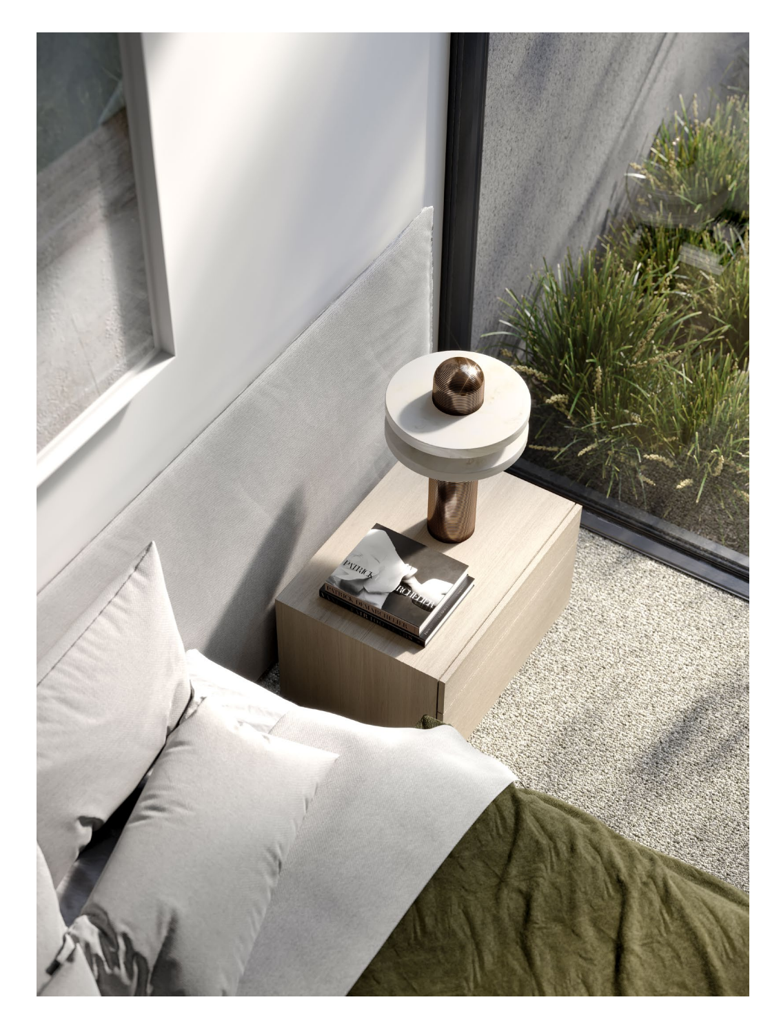
Breathtaking in beauty, spectacular in scale and uncompromised in quality, Azura Aspendale focuses on bringing moments of joy and delight to daily living.