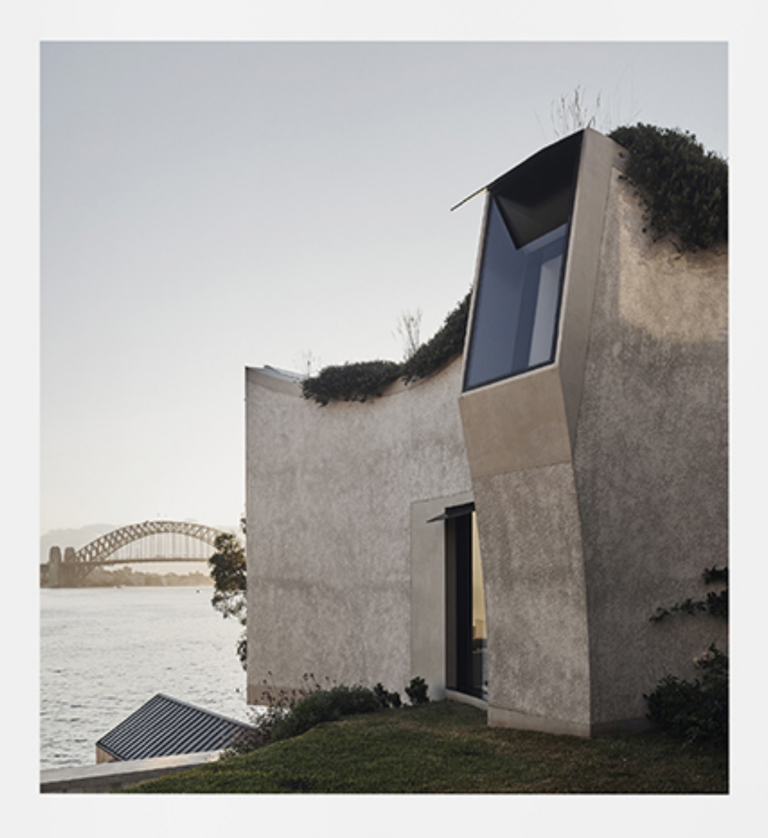
N°3 Architecture and Design of Australia and New Zealand

Walhelse House CHESHIRE ARCHITECTS • Redwood CHENCHOW LITTLE ARCHITECTS • Toorak Residence WORKROOM • Bismarck House ANDREW BURGES ARCHITECTS • Hampden Road ARCHIER • Kepler WOWOWA Sorrento Beach House PANDOLFINI ARCHITECTS — AND MORE