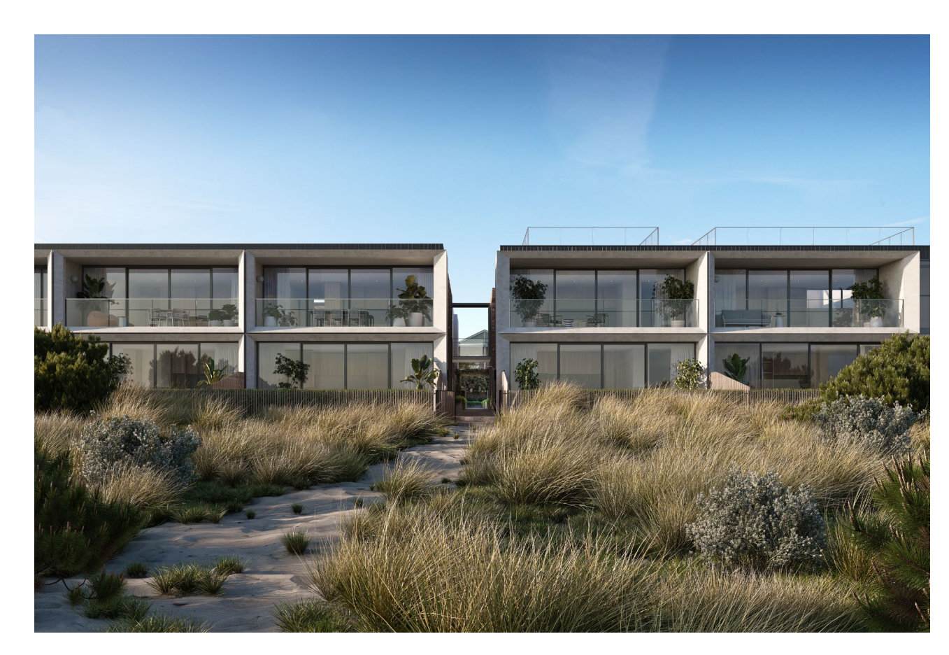
Material selection is both respectful to and mindful of the coastal surrounds, with lush native plantings and feature foliage to maximise privacy.

Prior to the Azura Aspendale project, Lowe Living had already established an enviable reputation for their careful consideration of every aspect of their projects. Responsible for the end-to-end development of luxury medium-density residential apartments and townhomes, Lowe Living are industry-leading property developers, who expertly construct their own projects. They are driven by a client-first approach, striving to redefine expectations, experiences and outcomes on every project they deliver.